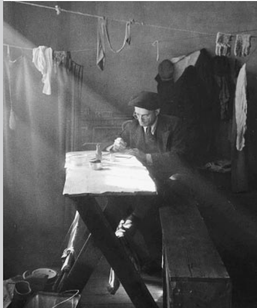
'Sunlight filters through into the dark rooms at Camp 2, Belsen.'

THE WIENER LIBRARY'S photo archive is a rich source of images, some beautiful, some striking, many horrific. Photographic testimony has an immediacy and power that is unmatched and these pictures deserve to be seen by more people than merely those able to visit the Library in person. Selections will be reproduced in the newsletter as an occasional feature. The images below come from the archive of the Jewish Relief Unit, which carried out welfare work in the Displaced Persons' camp at Bergen-Belsen. The images speak of endurance, survival and hope in the face of unimaginable suffering. The original captions are quoted. A further image can be found on page 7.