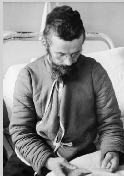
A Displaced Person in Belsen DP Camp – an image from the Archives.

In January the Education Officer represented the Library at an international conference 'Life Reborn: Jewish Displaced Persons, 1945-1951' organised by the