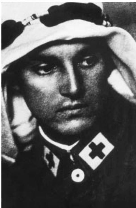
Armin Wegner as a young man in Armenia, where he witnessed the genocide.

For two weeks from 31 October the Library was host to a photo-exhibition based on the work of Armin T. Wegner, a German humanitarian who witnessed and