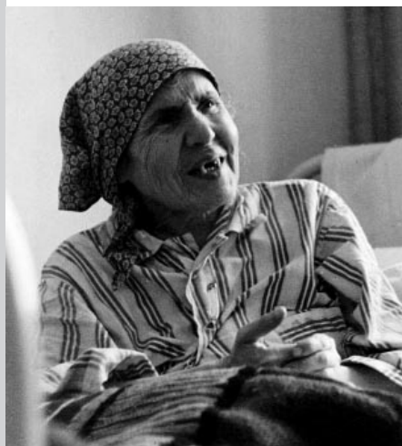
'Suffering from cancer.'

THE WIENER LIBRARY'S photo archive is a rich source of images, some beautiful, some striking, many horrific. Photographic testimony has an immediacy and power that is unmatched and these pictures deserve to be seen by more people than merely those able to visit the Library in person. Selections will be reproduced in the newsletter as an occasional feature. The images below come from the archive of the Jewish Relief Unit, which carried out welfare work in the Displaced Persons' camp at Bergen-Belsen. The images speak of endurance, survival and hope in the face of unimaginable suffering. The original captions are quoted. A further image can be found on page 7.