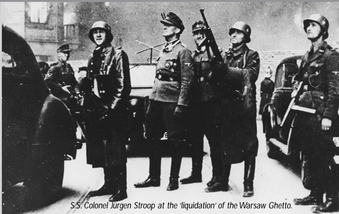
S.S. Colonel Jürgen Stroop at the 'liquidation' of the Warsaw Ghetto.