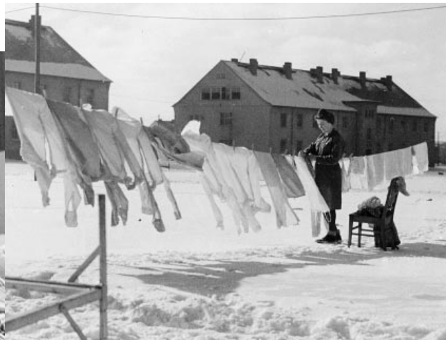
'Washing day in Belsen. The blocks of barrack buildings, which house many hundreds of DPs, are seen in the background.'